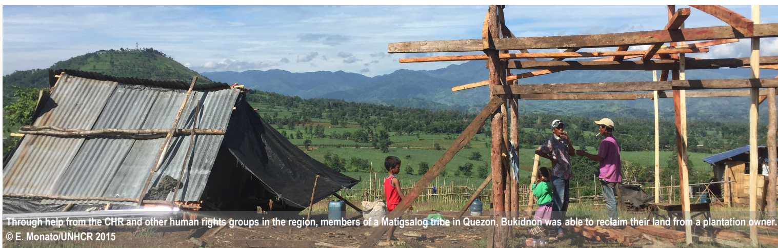
Through help from the CHR and other human rights groups in the region, members of a Matigsalog tribe in Quezon, Bukidnon was able to reclaim their land from a plantation owner.

As of this report, 30 families who are relatives and supporters of the victims fear to return to their communities in Cabanglasan. They are currently staying in the premises of Malaybalay Provincial Capital where they are protesting and calling for justice in response to the killings happening in their community. Cases have been filed in court and almost every day they are making a “noise barrage” in front of the Provincial Hall of Justice attempting to pressure the authorities to issue warrants of arrest to the suspected perpetrators of the killings.