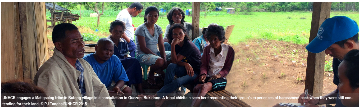
UNHCR engages a Matigsalog tribe in Butong village in a consultation in Quezón, Bukidnon. A tribal chieftain seen here recounting their group’s experiences of harassment back when they were still contending for their land.