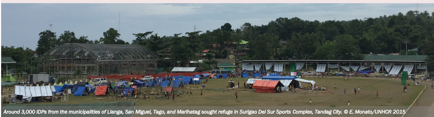
Around 3,000 IDPs from the municipalities of Lianga, San Miguel, Tago, and Marhatag sought refuge in Surigao Del Sur Sports Complex, Tandag City.

The human rights violations against the IP communities include Grave Child Rights Violations (GCRV) of killing, maiming, and attacks on schools. Perceived as political actions supporting “communist (NPA) ideology”, the IP communities are believed to be targeted for organizing against the government and corporations in their ancestral lands. This report does not include all incidents against IPs in Mindanao.