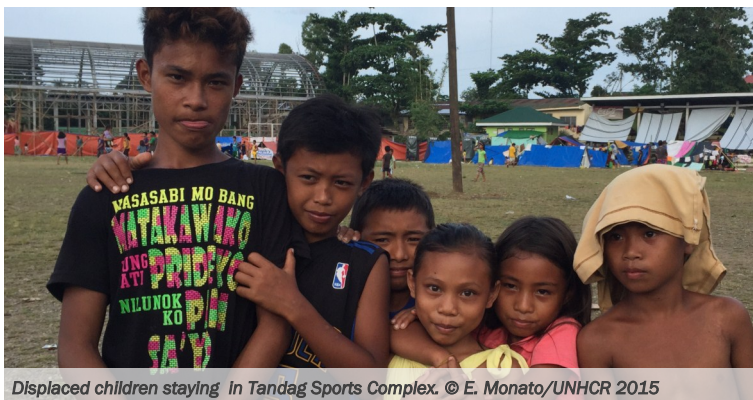
Displaced children staying in Tandag Sports Complex.

On 26 August 2015, in municipality of Kitaotao, 15 members of Nagkahiusang Mag-uuma sa White Culaman (United Farmers Association) including a mother and her 12-year-old son, were accused of being members of the NPA and were arrested by the AFP’s 8th Infantry Battalion. According to IP leaders interviewed by UNHCR, the military threatened to burn the alternative learning school built by Mindanao Interfaith Services Foundation, Inc. (MISFI)