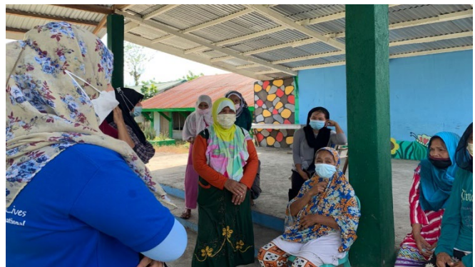
Protection monitoring of IDPs in Datu Mulok Elementary School on 16 February 2022