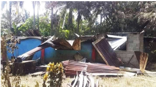
One house was burned as a result of the conflict.