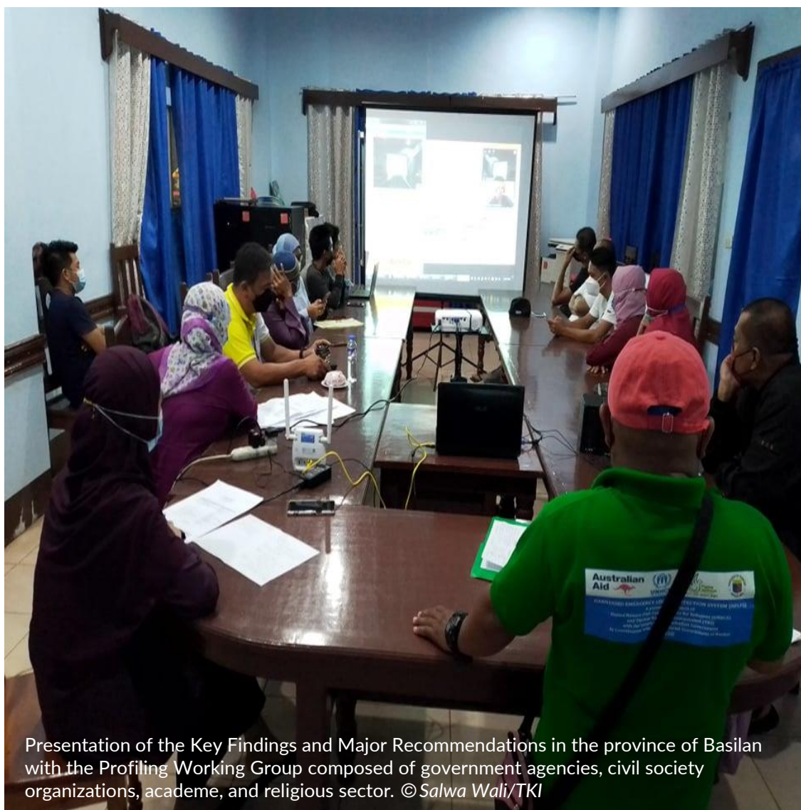
Presentation of the Key Findings and Major Recommendations in the province of Basilan with the Profiling Working Group composed of government agencies, civil society organizations, academe, and religious sector.

Report and Feedback from the Profiling Working Group during the Provincial Launching of the Profiling Reports