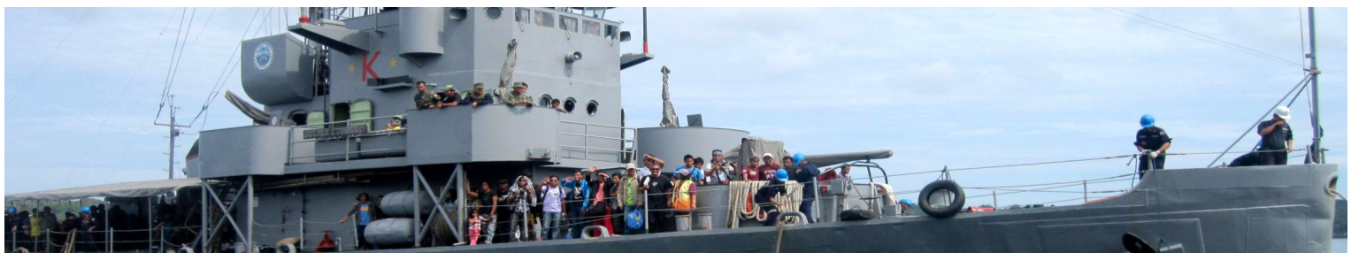
UNHCR in close coordination with local authorities recorded around 19,500 forced returnees from Sabah during the Sabah standoff in March 2013.