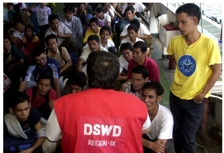
Briefing on the available humanitarian assistance to forced returnees and on the value of civil documentation are among the services being provided by the Processing Center for Internally Displaced Persons of the Department of Social Welfare and Development Office in Zamboanga City, Region IX.