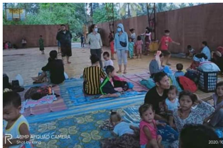
Some of the IDPs stayed inside a covered court in Brgy. Poblacion, Lamitan City.