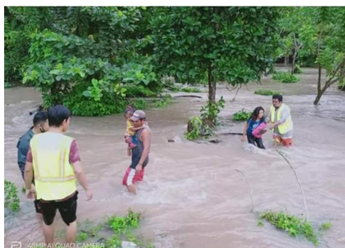
Some of the displaced families assisted by the Rescue volunteer group.