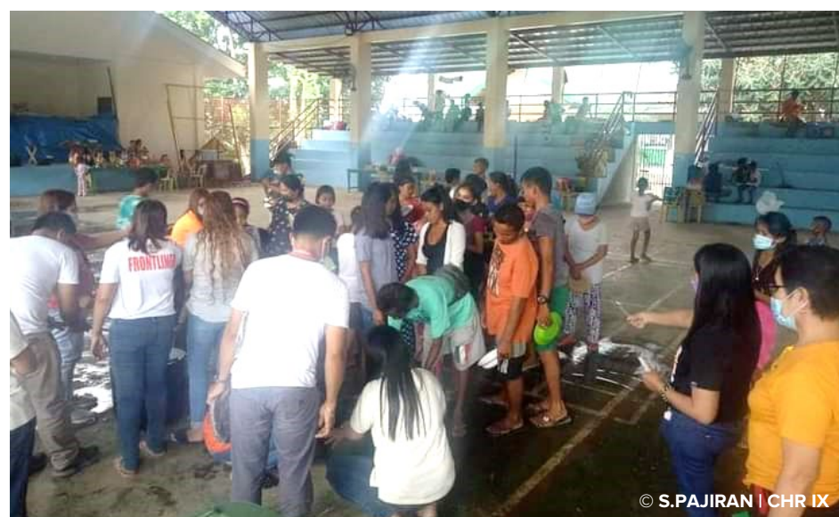
Some of the displaced families during the free lunch provided by an international organization in the covered court.