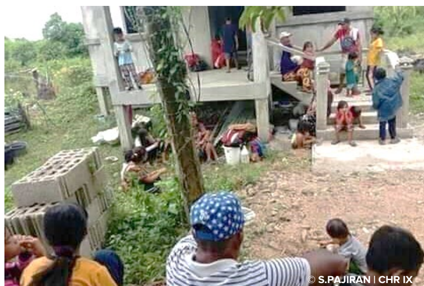
One of the temporary shelters occupied by the IDPs in the displacement location.