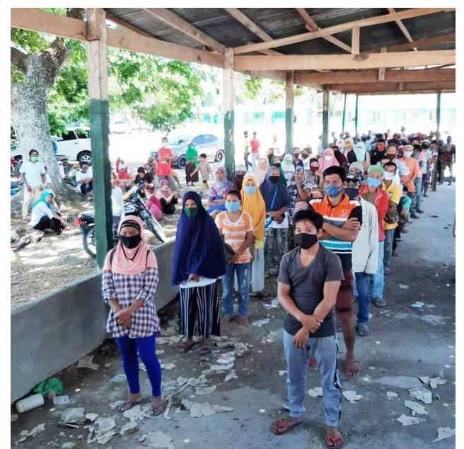
This distribution of Core Relief Items (CRIs) to a total of 944 families is supported by the Australian Government and implemented by UNHCR Philippines and CFSI - Community and Family Services International. Forcibly displaced families from the municipalities of Ampatuan and Guindulungan received hygiene kits, blankets, plastic tarpaulins, solar lamps, and mosquito nets.