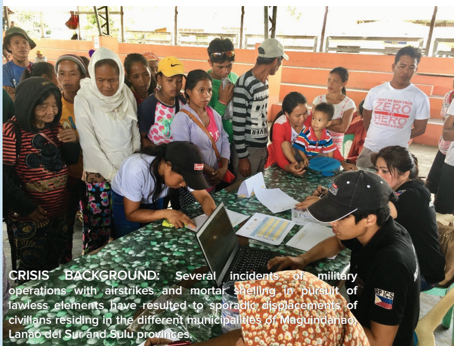
CRISIS BACKGROUND: Several incidents of military operations with airstrikes and mortar shelling in pursuit of lawless elements have resulted to sporadic displacements of civilians residing in the different municipalities of Maguindanao, Lanao del Sur and Sulu provinces.

Its mission is to work with communities to address the underlying causes of injustice and poverty towards lasting peace and sustainable development in Mindanao.