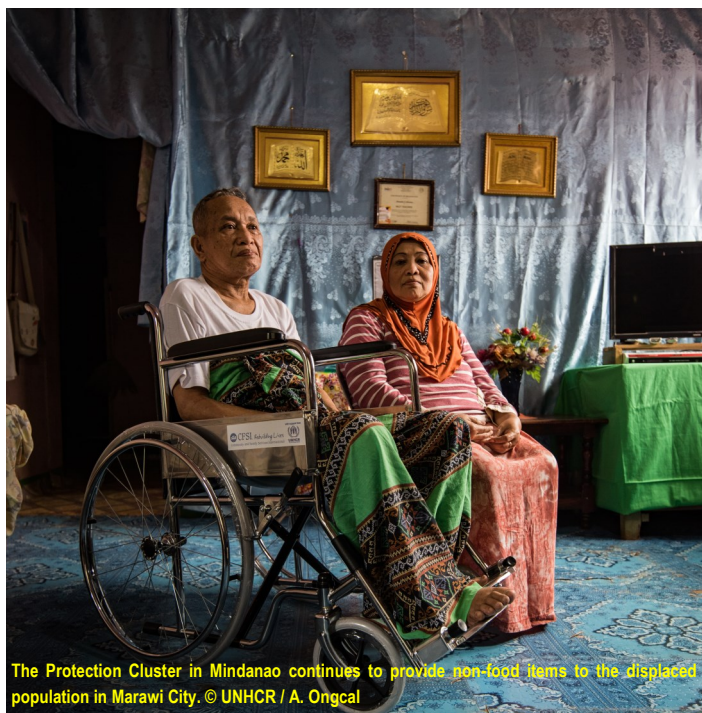
The Protection Cluster in Mindanao continues to provide non-food items to the displaced population in Marawi City.

During the first joint meeting between representatives of the Marawi City local government unit and the Inter-cluster Coordination Group on 26 January, it was agreed that simultaneous site visits would be conducted on 29 January in identified sites for return or (temporary) relocation of IDPs. The aim is to determine capacity of the sites to accommodate the planned number of IDP families for return/relocation, and to provide assessments on issues within the purview of each Cluster, as inputs to the Site Development Plan. This would be followed by a presentation of the results and a planning meeting with the Marawi City Mayor on 31 January. The agreement is to prioritize IDPs currently staying in Iligan City, which include families from the most affected areas of Marawi who could not yet return. Relocation to other evacuation sites within Marawi has been previously proposed as an interim solution for IDPs from areas that had not yet been cleared as safe for return.